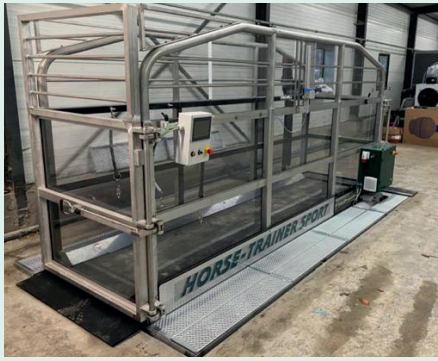
The machine can be built into the floor plan. For safety – It's an option to buy a high door.