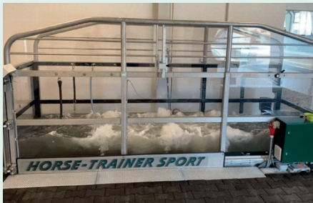
Active SPA function.