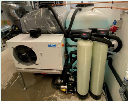
Two tank option system. One 4000L isolated tank with cooling system and one 4000L tank for pure water.