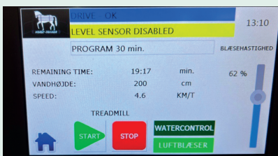
Touchscreen with band and blower control for spa function.