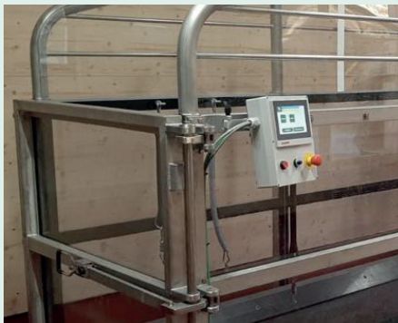
The programs are operated on the rotatable touchscreen at the horse's head for safety.