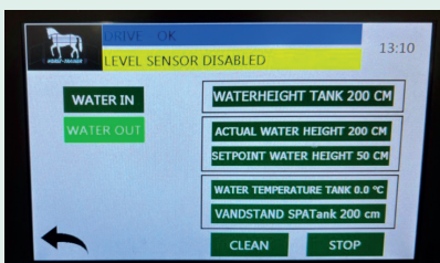
Touchscreen with water level control.