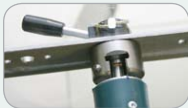
Adjustable safety rear bar