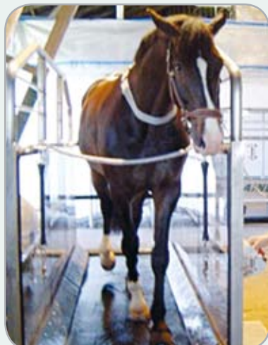
HORSE-TRAINER WATER can also be used without water and adjusted for up hill work