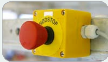
The water treadmill is provided with 3 emergency stop buttons