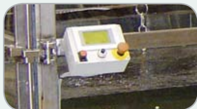
Operated at the horse's head, which ensures safety

International tests on this alternative training method show that "it is a perfect solution for accelerated conditioning, improved performance, promotes correct posture and a balanced gait, improves the heart function, enhances muscle development and improves flexibility." Furthermore, measurements have shown that rehabilitation on the water treadmill reduced the recovery time by 50-60%.