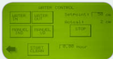
Automatic water control via display

The computer can register up to 100 horses in the name register.