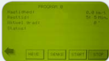
The display shows speed, remaining time, and belt inclination