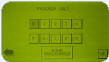
Pre-programmed with 10 fixed programs