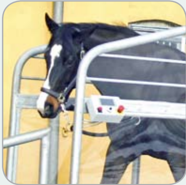
Operated at the horse's head, which ensures safety