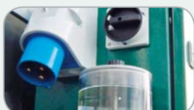
HORSE-TRAINER is also available for single-phase electricity 240 VAC +N+PE - 32A

HORSE-TRAINER WALK is incredibly reliable, and the machine has been fully electroplated, which makes it resistant to rain, snow and bad weather. HORSE-TRAINER are easy to maintain. We have treadmills installed at yards in north Sweden with winters where snow and minus degrees down to -25^{\circ}\text{C} is everyday life, and in Dubai with dust, heat, sun and degrees above 45^{\circ}\text{C} . HORSE-TRAINER works everyday under these conditions. These machines are installed outdoor, only provided with the maintenance-free roof for HORSE-TRAINER, making this solution easy and space saving.