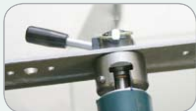
Adjustable safety rear bar