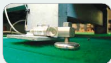
Can be equipped with weighing cells