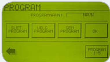
Programs up to 100 individual programs