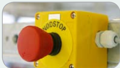
HORSE-TRAINER is provided with 3 emergency stop buttons