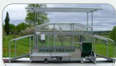
Can be provided with maintenance-free roof