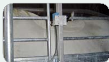
The stumble protection can be adjusted from 135-175 cm