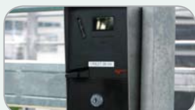
Can be mounted with coin box